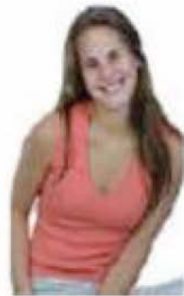
Low cut tops