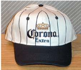
Clothing advertising: alcohol, tobacco or messages that can be construed as a sexual innuendo or other non-Christian message