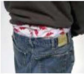
Low riding pants that expose underwear