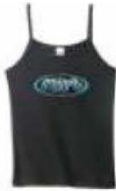
Tops that expose undergarments