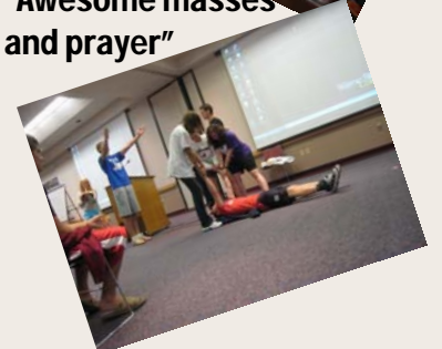
"I learned while having fun"