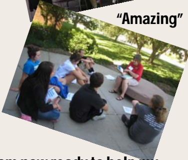
"I am now ready to help my parish and school"