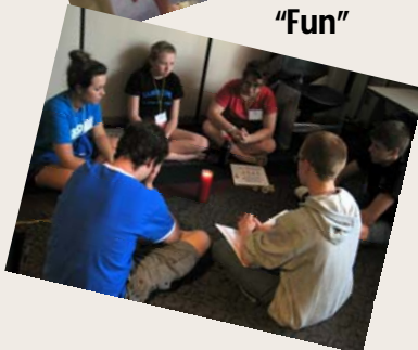
"Nothing I have ever experienced before"