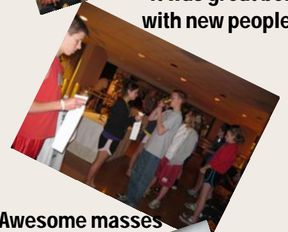
"Awesome masses and prayer"