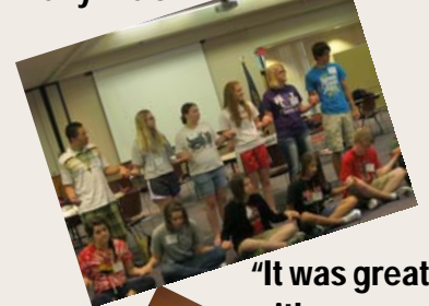
"It was great being with new people"